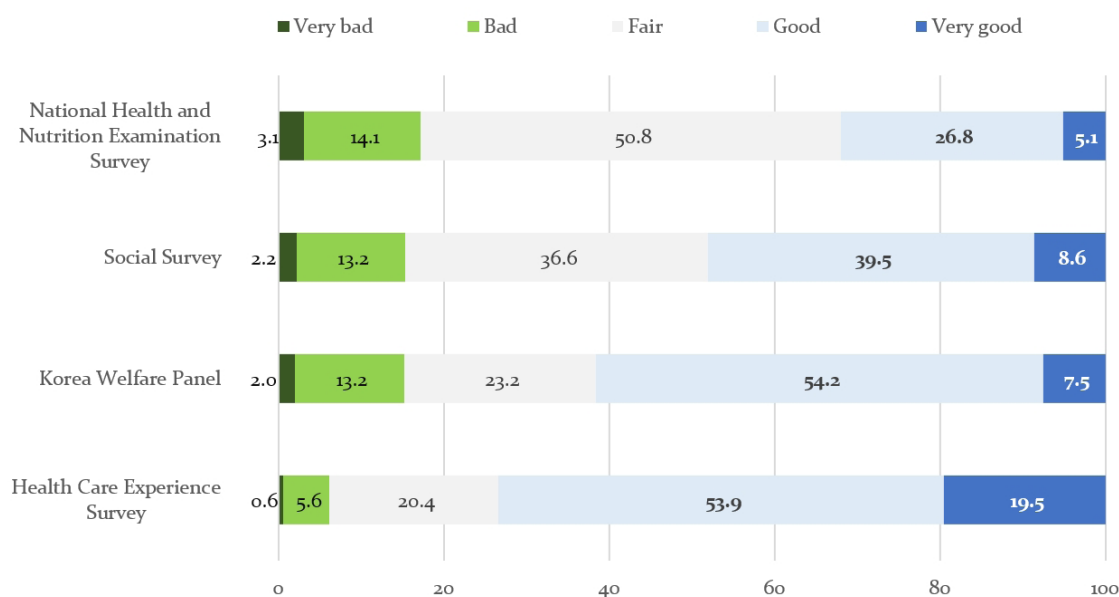
[Figure 2] Perceived health status in people aged 15 and older, by survey